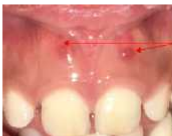
Figure 3: Intraoral examination: fistulized abscesses in the area of teeth 51 and 61

The endobuccal examination showed that the child had poor oral hygiene along with chronic marginal gingivitis and fistulized abscesses apically to the apparently healthy 51 and 61 teeth ( Figure 3 )