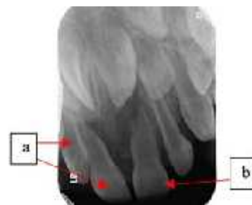
Figure 4: Radiological examination: a. large pulp cavity, b. reduced mineralized tissue thickness.

A retro-alveolar radiography was performed as the hyperactivity of the patient did not allow the use of a panoramic radiograph. It indicated the presence of a large pulp cavity with elongated corn associated with a significantly reduced mineralized tissue thickness and a radiolucent image at the apical level of the 51 and 61 teeth ( Figure 4 ).